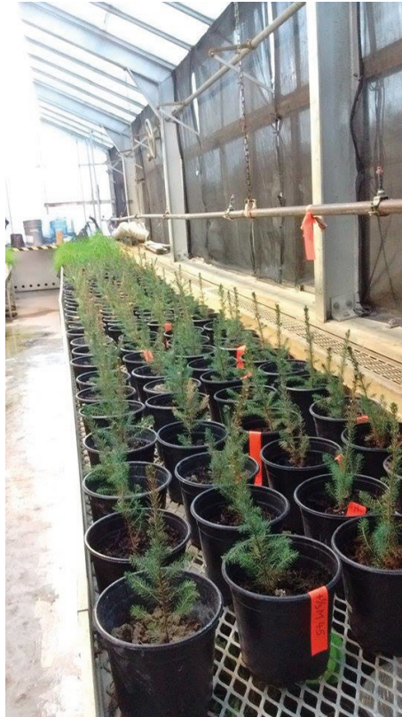
Fig. 1. Randomized distribution of 130 potted black spruce seedlings on the greenhouse bench. The pots contained black spruce seedlings transplanted into six substrates prepared from field-harvested material collected in a spruce-feather moss site located on the Clay Belt of Quebec and Ontario (Canada).

K, Ca and Mg by plasma atomic emission spectroscopy (Thermo Jarrel-Ash-ICAP 61E, Thermo Fisher Scientific, Waltham, MA).